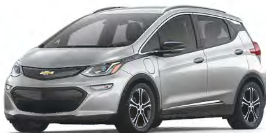
Silver Ice Metallic 1