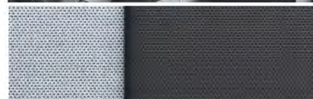
Dark Galvanized Gray Cloth with Sky Cool Gray Accents