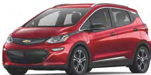
Cajun Red Tintcoat 2