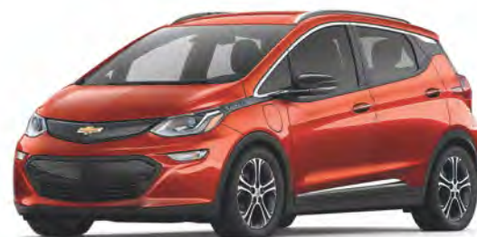
Cayenne Orange Metallic 2