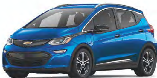
Kinetic Blue Metallic 2