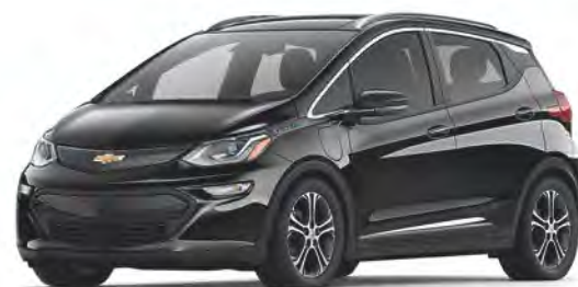
Mosaic Black Metallic