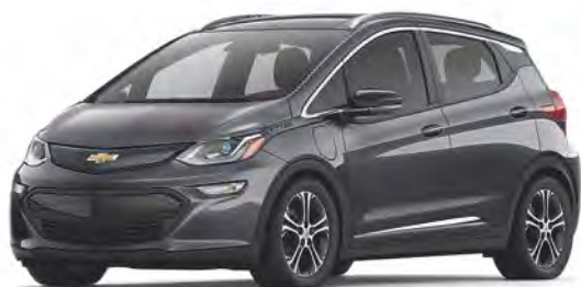
Nightfall Gray Metallic