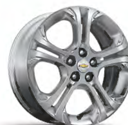
17" Painted-Aluminum Wheels Standard on LT