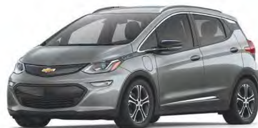
Slate Gray Metallic