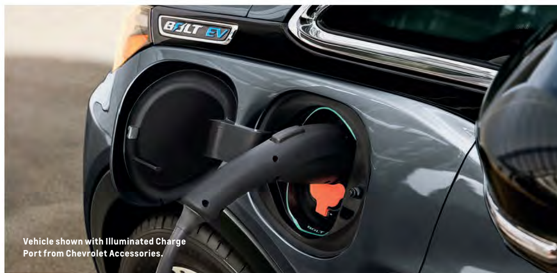
Vehicle shown with Illuminated Charge Port from Chevrolet Accessories.