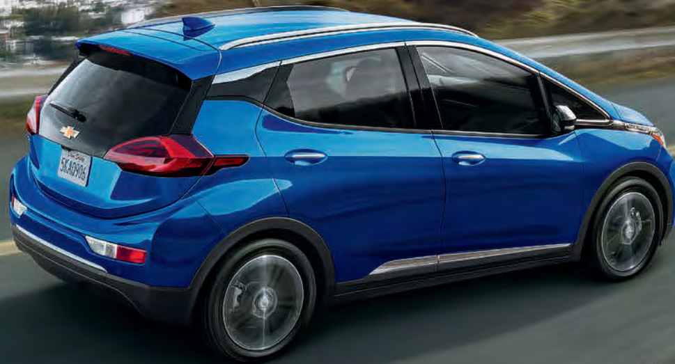
Bolt EV Premier in Kinetic Blue Metallic (extra-cost color).