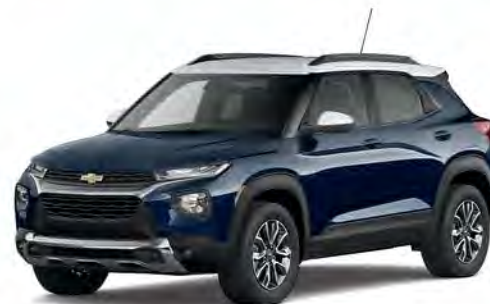
Midnight Blue Metallic 2,4