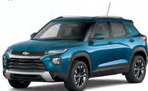
Pacific Blue Metallic 2,3,4