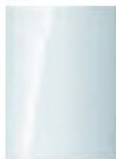
Summit White/ Summit White