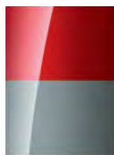
Scarlet Red Metallic/ Satin Steel Metallic