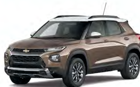
Zeus Bronze Metallic 5