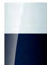
Summit White/ Midnight Blue Metallic