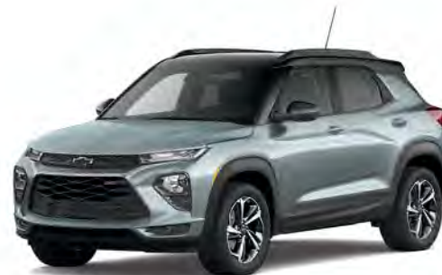
Satin Steel Metallic 2