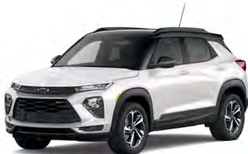
Iridescent Pearl Tricoat 1,2