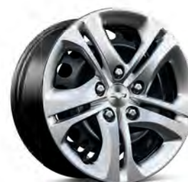
16" Steel Wheels with Bolt-On Wheel Covers Standard on L