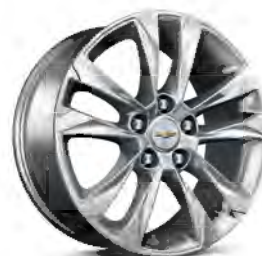
17" Silver-Painted Aluminum Wheels Standard on LS