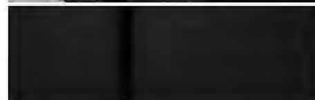
Jet Black Cloth