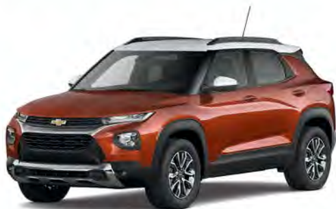
Dark Copper Metallic 2,4