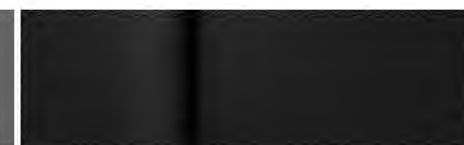
Jet Black Leatherette Seating Surfaces 1 (shown)