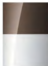
Zeus Bronze Metallic/ Iridescent Pearl Tricoat 1