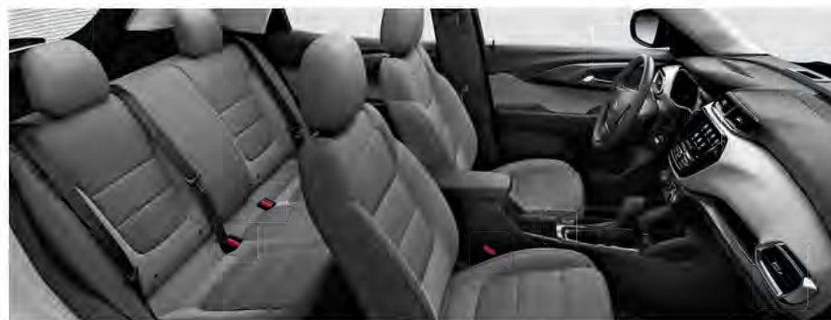
Medium Ash Gray Cloth (shown)

Seat – flat-folding front passenger seatback