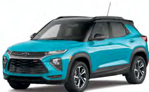
Oasis Blue 6