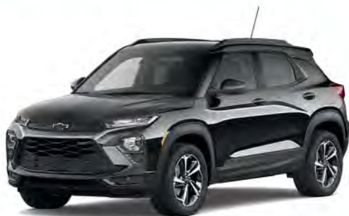
Mosaic Black Metallic 2

1 Extra-cost color. 2 Not available on L. 3 Not available on ACTIV. 4 Not available on RS. 5 Available only on ACTIV. 6 Available only on RS.