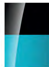
Mosaic Black Metallic/ Oasis Blue