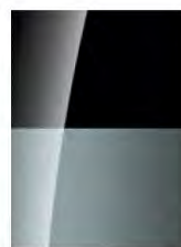
Mosaic Black Metallic/ Satin Steel Metallic