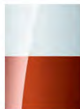
Summit White/ Dark Copper Metallic