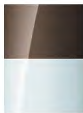
Zeus Bronze Metallic/ Summit White