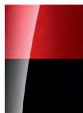
Scarlet Red Metallic/ Mosaic Black Metallic