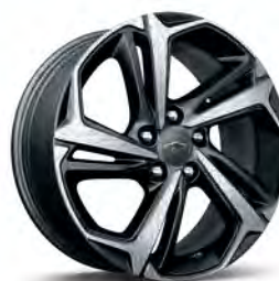
18" High-Gloss Black Machined-Aluminum Wheels Standard on RS