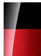
Mosaic Black Metallic/ Scarlet Red Metallic