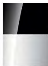
Mosaic Black Metallic/ Iridescent Pearl Tricoat 1