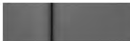
Medium Ash Gray Leatherette Seating Surfaces 1