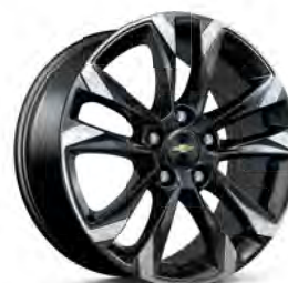
17" High-Gloss Black Machined-Aluminum Wheels Standard on LT