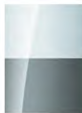
Summit White/ Satin Steel Metallic