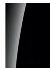
Mosaic Black Metallic/ Mosaic Black Metallic