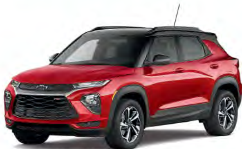
Scarlet Red Metallic 2,3