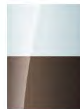
Summit White/ Zeus Bronze Metallic