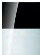
Mosaic Black Metallic/ Summit White