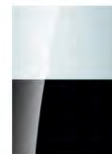
Summit White/ Mosaic Black Metallic